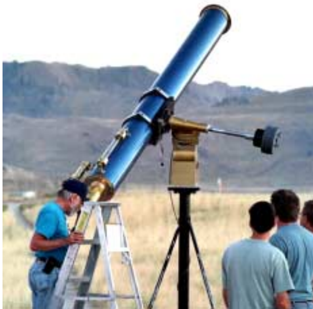
Refractors are capable of producing sharper images than reflecting telescopes of the same aperture, but are big, heavy and expensive. Siegfried Jachmann's nine-inch Clark Refractor offers eye-popping views of the planets, but taking it to a Star Party is not a simple task.

A few amateur astronomers do have, use and lovingly maintain refracting telescopes with apertures between four to eight inches. These telescopes are heavy, large, delicate and time-consuming to set up. A well-made refracting telescope can deliver more finely detailed images of planets and stars than a reflecting telescope of equivalent aperture, but this type of performance comes at a price. A six-inch reflecting telescope can be bought new for a few hundred dollars. However, if you have to ask how much a high-quality six-inch refracting telescope costs, then you can't afford one.