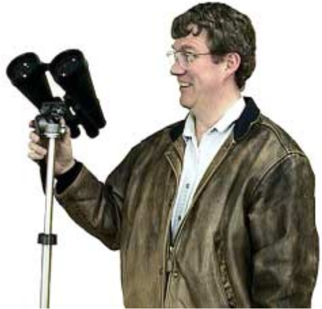
Giant binoculars such as these 11x80's (11 power magnification, 80 mm apertures) are great for night use, but are heavy and require a tripod for a stable view.

The Andromeda Galaxy, so large and bright that even from a distance of over 2 million light years it is visible to the naked eye,