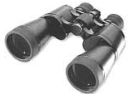
A good quality pair of 7x50 binoculars are ideal for a beginning amateur astronomer.

If you are not 100% certain that you are ready to be a telescope owner, then spare yourself the expense and effort associated with a telescope and start out with a set of decent 7x50 binoculars. If one night you find yourself straining through your binoculars in an attempt to view the Ring Nebula, then you know you are ready for a telescope.