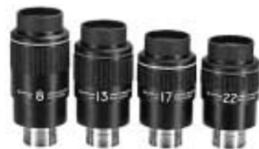
A telescope that accepts interchangeable eyepieces gives the user a wide variety of options for magnification and field of view.

To obtain greater magnification (but with a narrower field of view, a darker image and a smaller opening in the eyepiece to look through), the telescope operator changes to an eyepiece having a shorter focal length. For example, a 1,000 mm focal length telescope using an 8 mm focal length eyepiece will achieve 125 power magnification.