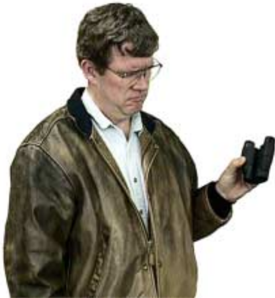
Small binoculars such as this set of 8x25's (8 power magnification, 25 mm apertures) may work well in daylight but don't gather enough light for use at night.

Because the consequences of buying a telescope wisely or unwisely are so dramatic, let's quickly review the eight basic rules of wise telescope shopping.